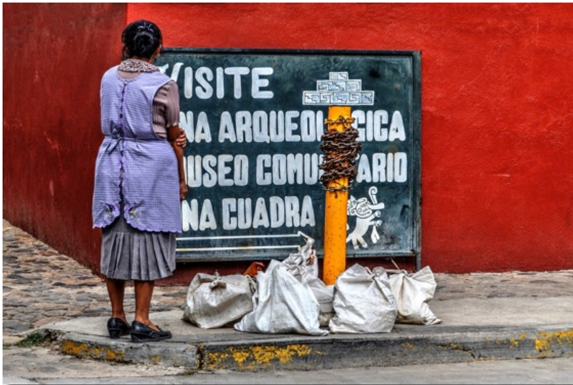
"Dinner in a Bag" - This woman was shot on the streets of Teotitlan, Mexico. She is waiting for a taxi to take her and her bags of live chickens home to prepare the evening meal. Some of these birds will likely be kept in a coop to produce eggs for the family. As she waits, she seems to be contemplating visiting the museum at some point as suggested by the signage.