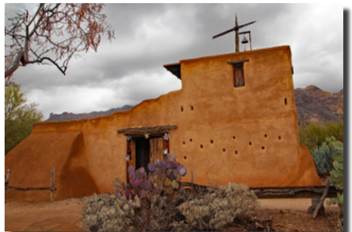
De Grazia Chapel