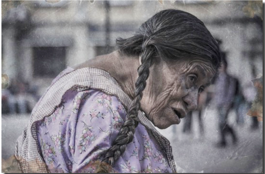
"Oaxacan Street Vendor" - The lines in her face, the crook in her neck depict a tough life. A life of long hours selling her wares for a few pesos each at the plaza in Oaxaca, Mexico.